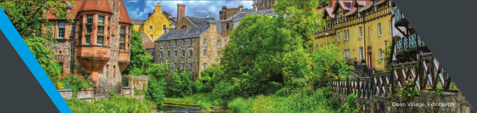
Dean Village, Edinburgh