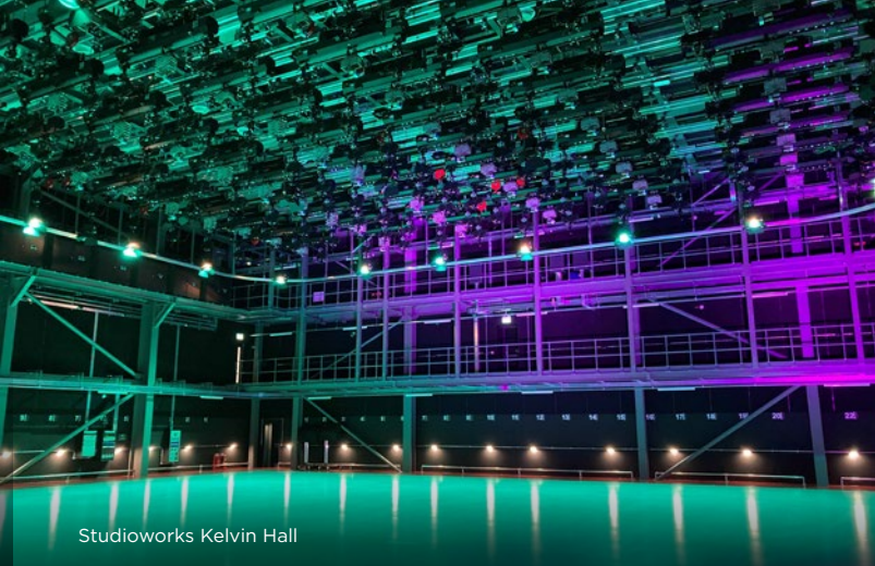
Studioworks Kelvin Hall