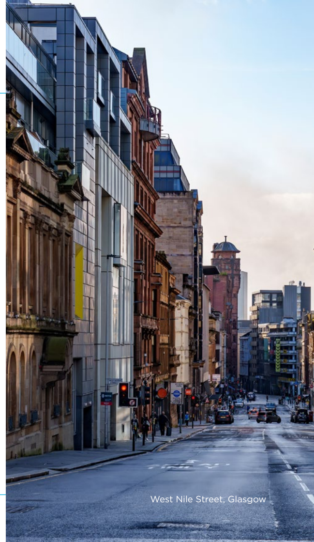
West Nile Street, Glasgow

E: locations@creativescotland.com screen.scot