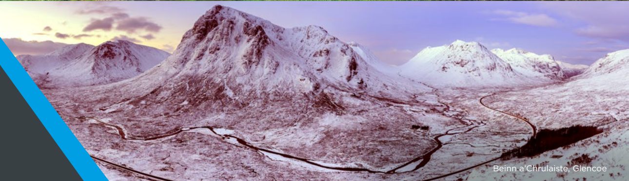
Beinn a'Chrulaiste, Glencoe