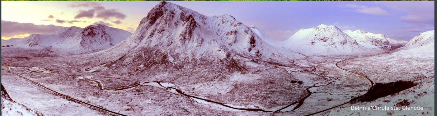
Beinn a'Chrulaiste, Glencoe