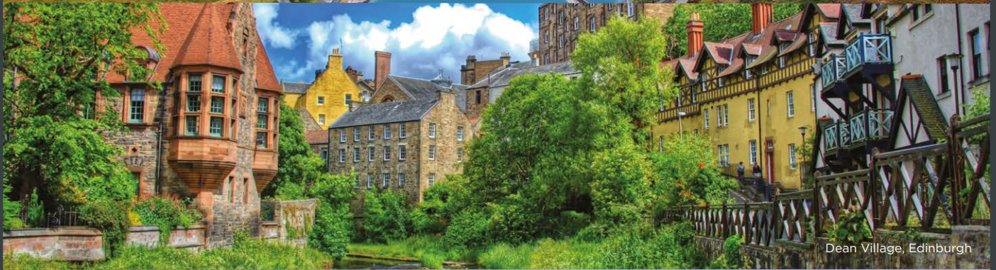
Dean Village, Edinburgh