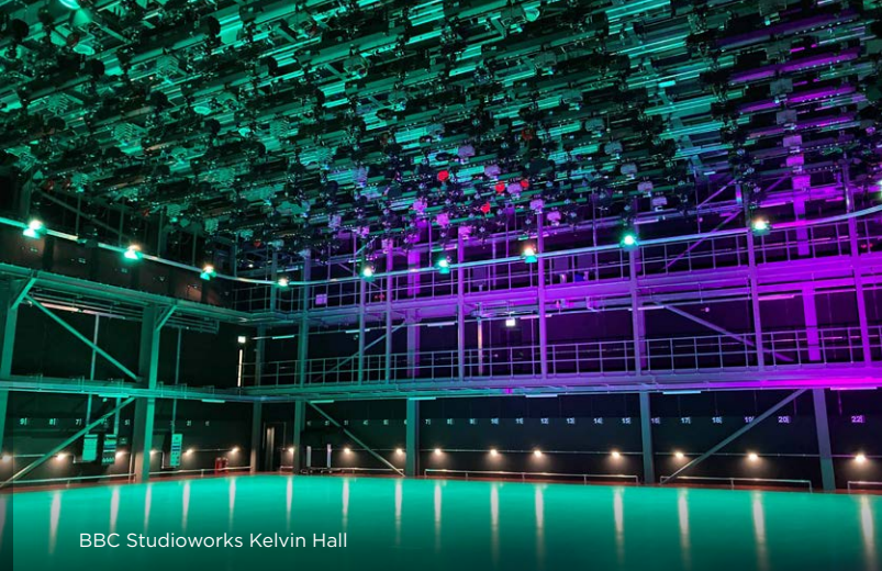
BBC Studioworks Kelvin Hall